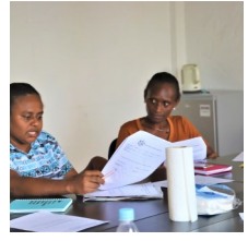
KoBLE Board Planning for the Annual Reflection & Induction Workshop