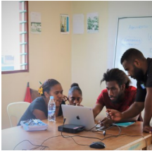
YAR Project Video on Youth Perspectives on COVID-19 Impacts