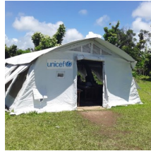
KoBLE Engages in Humanitarian Performance Monitoring in Schools