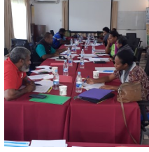
Ministry of Education and Training's Policy Consultation Workshops