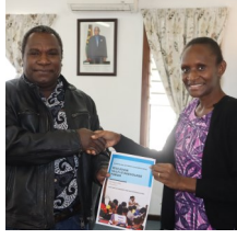
KoBLE Presents the 8th April, 2021 Forum's Outcome Statement to MoET