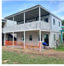
Pikinini Playtime School: Full To Capacity!