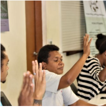
KoBLE 2022 Annual Report