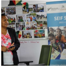
KoBLE Participates in the First 2023 MoET Safe School Technical Working Group Meeting