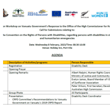
KoBLE Participates in Vanuatu Government's Response Consultation on Human Rights